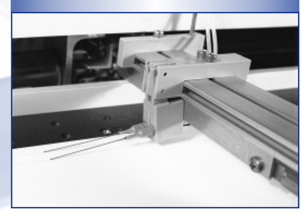
LCP nozzles dispensing